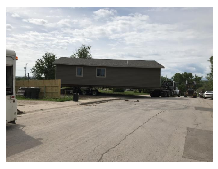
Moving day - June 18th