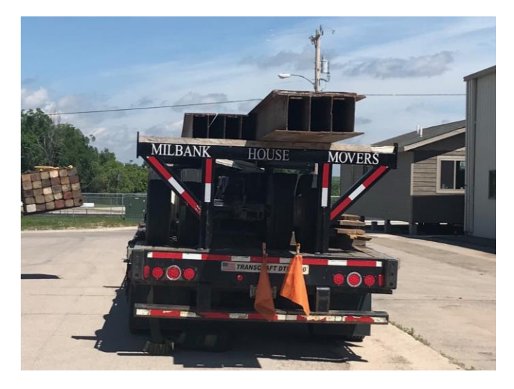
Prepping for the move - June 17th