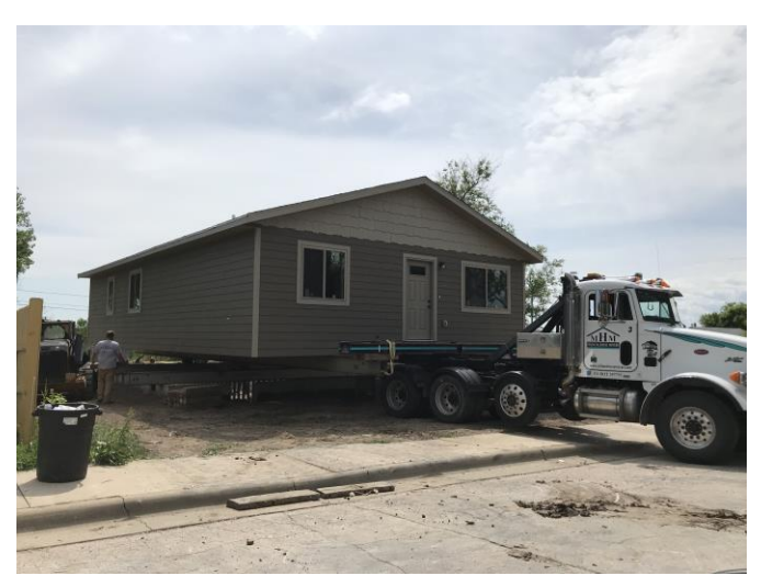
211 9th Ave, Belle Fourche