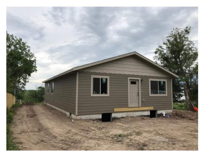
Getting ready for finishing touches.