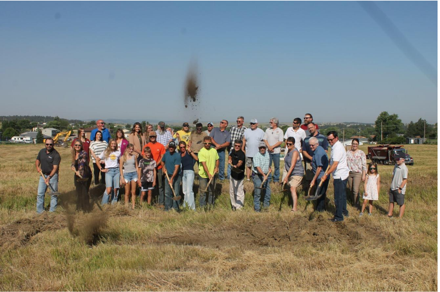
RIDGE VIEW ESTATES BREAKS GROUND ON THE NORTH SIDE OF XAVIER STREET IN BELLE FOURCHE.

By Sierra Ferguson | Black Hills Pioneer