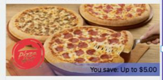
Large 3 Topping for $9.99 Belle Fourche, South Dakota