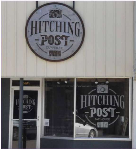
THE HITCHING POST TAP HOUSE, 519 1/2 STATE ST.

The Hitching Post Tap House opened the doors for its Grand Opening at 519 1/2 State Street Friday June 4th. Belle Fourche's newest downtown business will be open 3 to 10 PM and will have on tap, and be serving, a variety of craft beers.