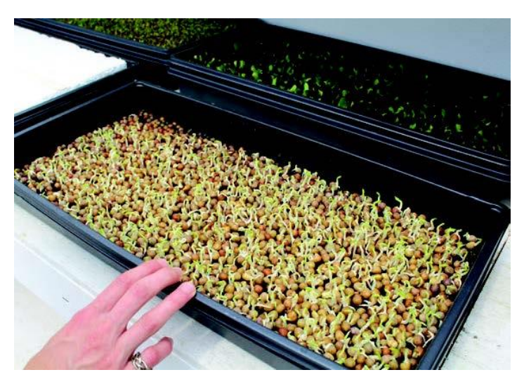
A tray of sunflower sprouts just getting going. The sprouts have to have a weight placed on them as they are sprouting so they grow upwards.