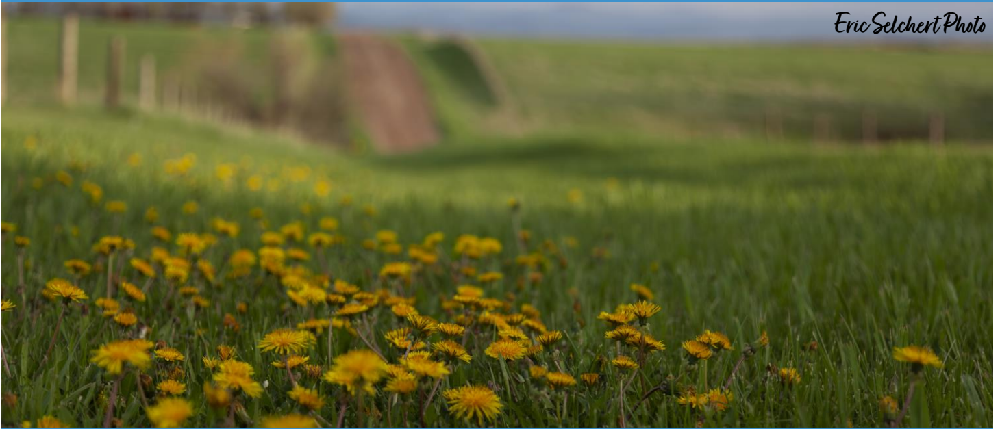
Eric Selchert Photo