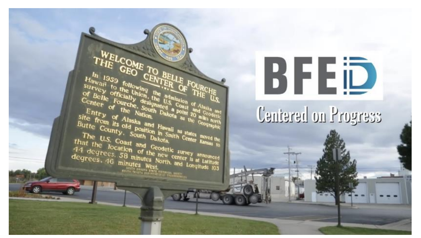
View the video from the annual meeting showing some of the many community successes: https://youtu.be/xNcTpAjWwzA