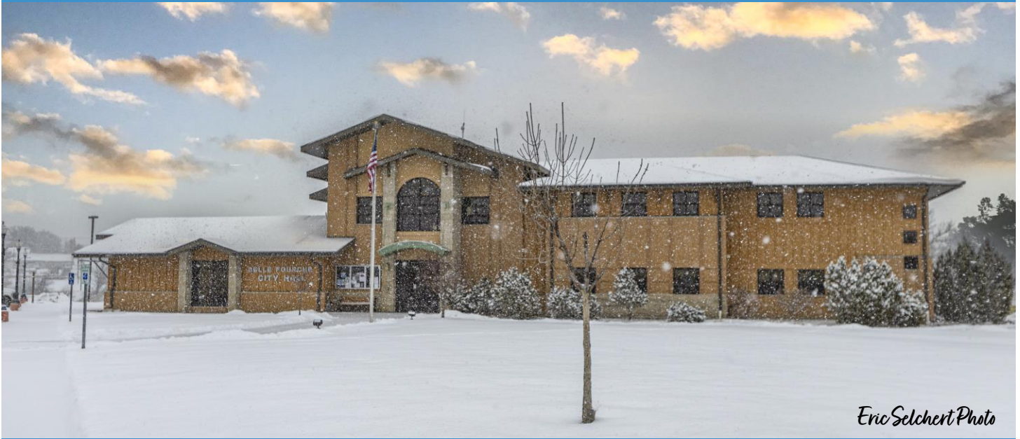
Eric Selchert Photo