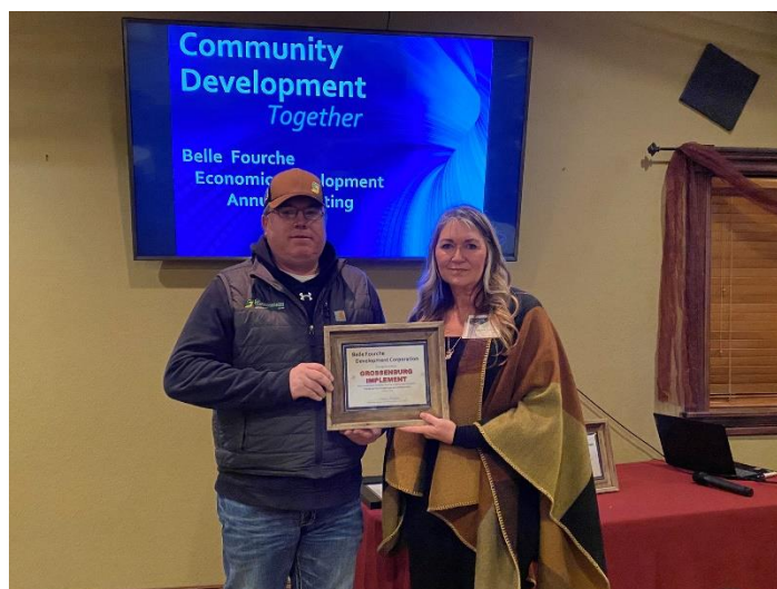
BUSINESS EXPANSION – Grossenburg Implement