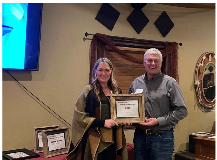
BUSINESS EXPANSION – CBH Coop