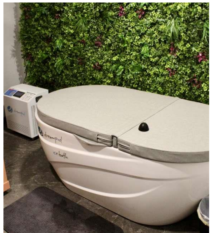
One of the recovery rooms is called the Ice Room and it is for Contrast Therapy. It contains both a cold plunge and a sauna.

Just hope that people will keep coming. I met some of my lifelong friends at a gym.”