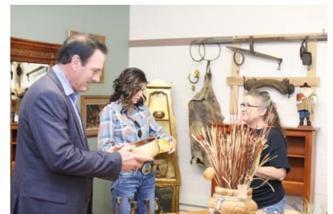
DESIGNS BY DAPHNIE