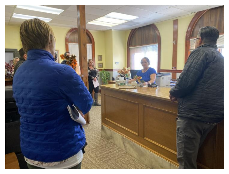
class what vital records are kept in their office.